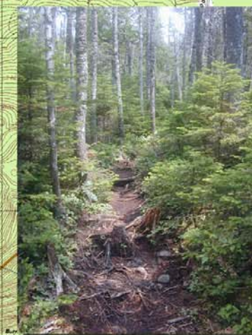
View 10: Typical wooded trail between Sugarloaf and Spaulding Mtns.