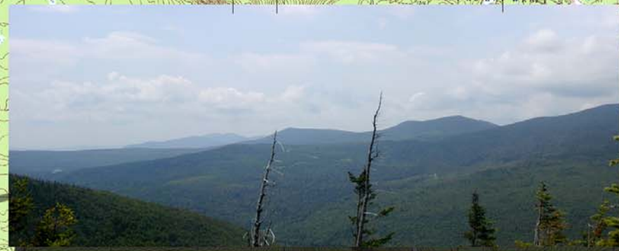
View 8: Open view from edge of Sugarloaf Cirque. The wind turbines will not be visible from the Cirque.