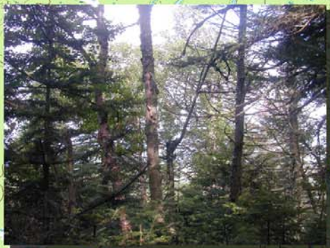
View 14: Filtered view from Lone Mtn. The wind turbines will not be visible.