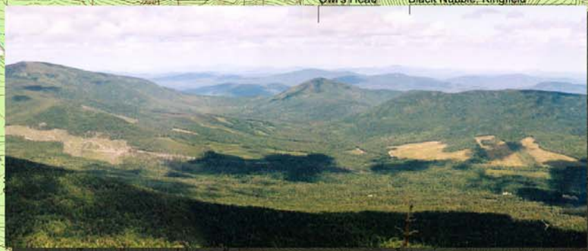
View 12: View of clear cuts as seen from Mount Abraham.