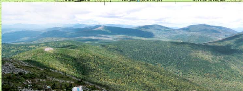
View 13: Visualization from Mount Abraham, side trail off the Appalachian Trail. The wind turbines will be visible at distances of 6.5 to 7.3 miles and occupy a 12° view angle.