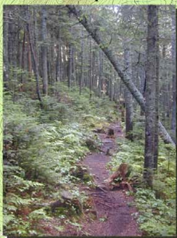
View 11: Typical trail between Spaulding and Lone Mtns.